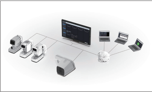
Network in Huvitz Integrated Image Server(HIIS-1)